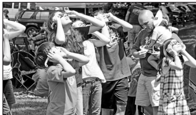
Meeks Park visitors turn their protected eyes to the sun as the eclipse begins its partial phases on Monday, Aug. 21.

The Union County Sheriff's Office had everyone in the office out on patrol, as did the Blairsville Police Department.